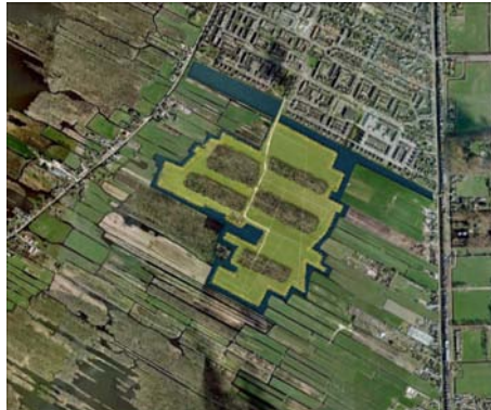
Sample design Refuse-dump Kortenhoef: Future situation