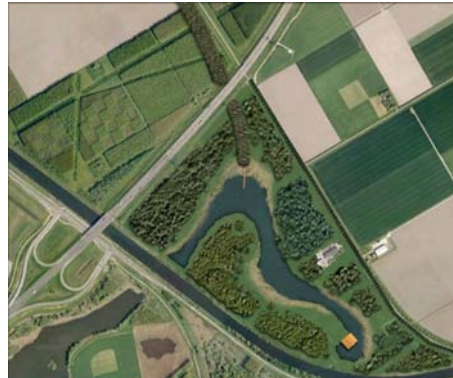
Sample design Reclaimed land: Future situation