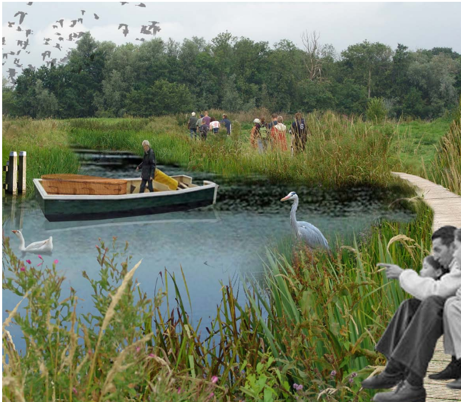
'Sailing severance in the moorland', an impression

In summary we would like to make some recommendations: