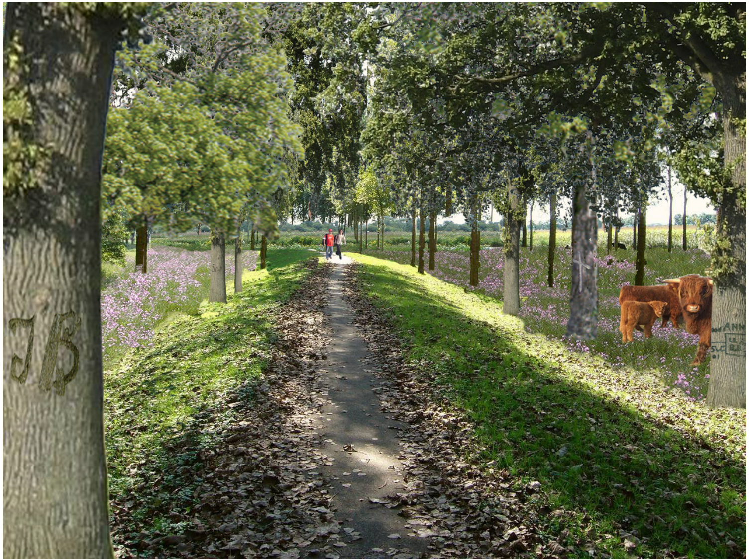
'Countless memories on a country estate', an impression

The emergence of natural burial sites is an international phenomenon. The present Dutch supply however doesn't meet the rising demand. Demographic aging will only increase the need for burial space. Natural burial sites can provide a sustainable, attractive and highly upgraded way to tune supply and demand.