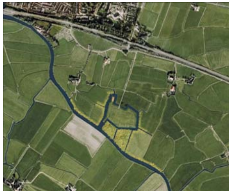
Sample design Terps on clayish soil: Future situation