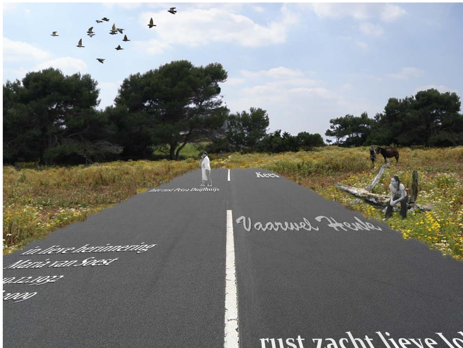
'Last Post at a former military airport', an impression