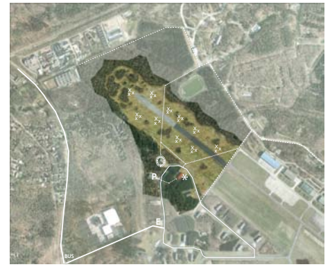
Sample design former Military airport: Intended functions