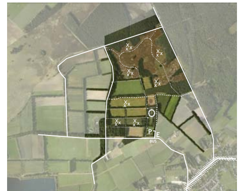
Sample design on sandy soil and Open fields: Intended functions