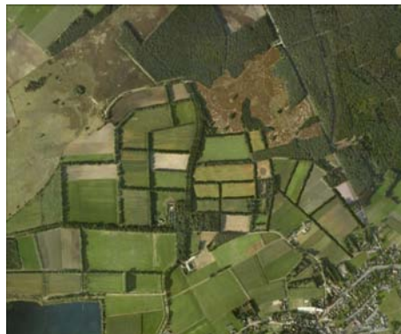
Sample design on sandy soil and Open fields: Future situation