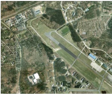
Sample design former Military airport: Present situation