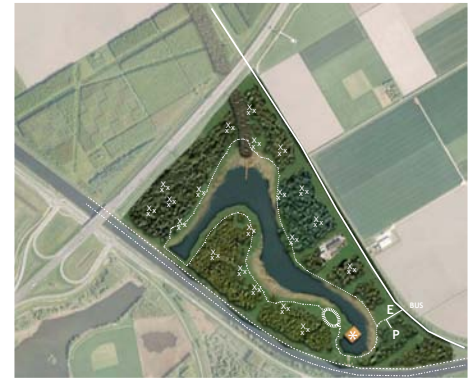
Sample design Reclaimed land: Intended functions