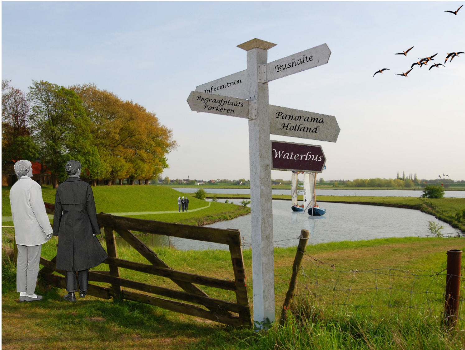
'Farewell on a former fortress', an impression