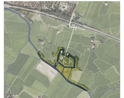
Sample design Terps on clayish soil: Intended functions