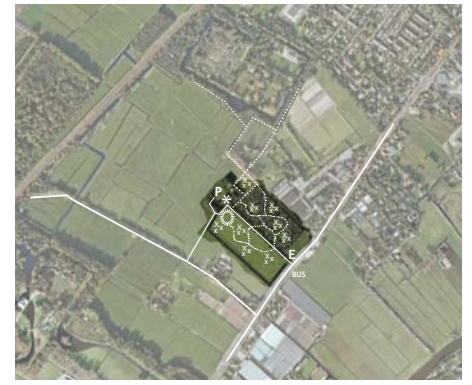
Sample design Country estates in coastal area: Intended functions