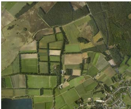
Sample design on sandy soil and Open fields: Present situation