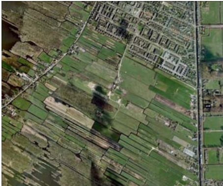
Sample design Refuse-dump Kortenhoef: Present situation