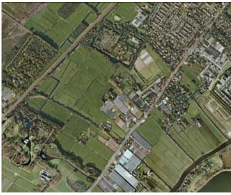
Sample design Country estates in coastal area: Present situation