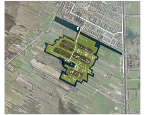
Sample design Refuse-dump Kortenhoef: Intended functions