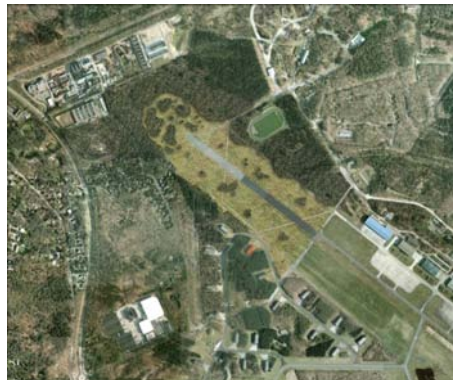
Sample design former Military airport: Future situation