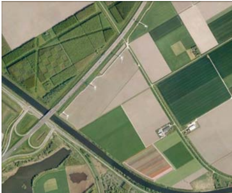
Sample design Reclaimed land: Present situation