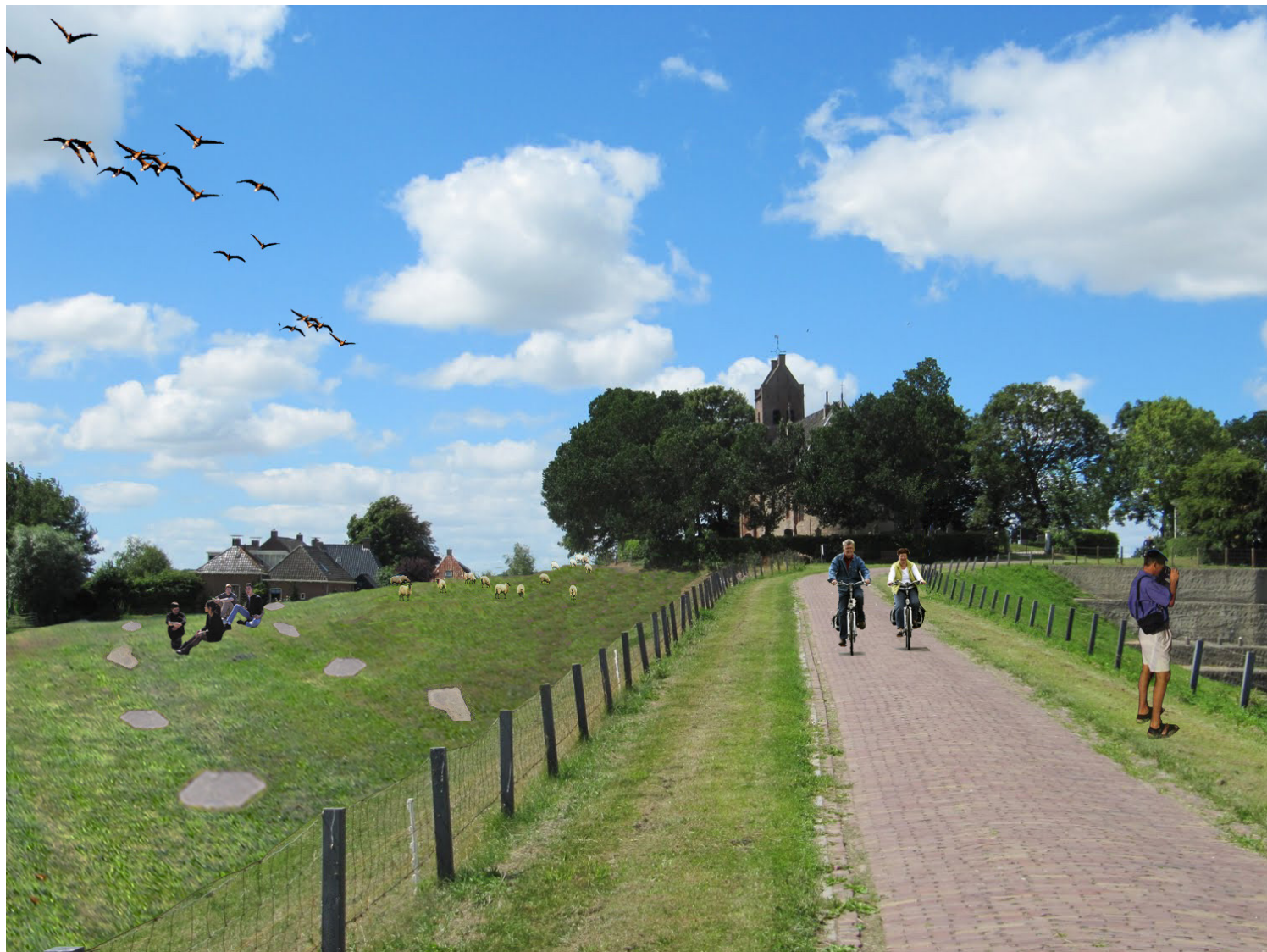
'Restoration of an Ancient Terp', an impression