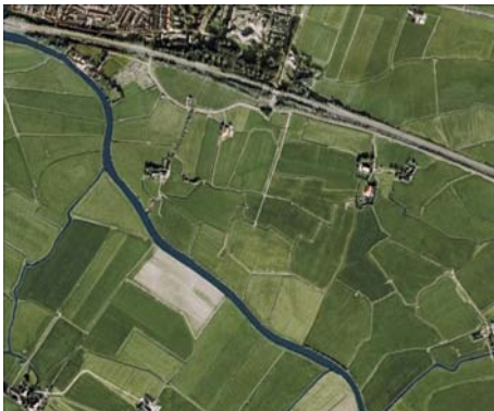
Sample design Terps on clayish soil: Present situation