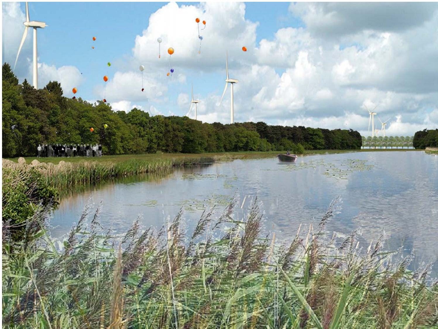
'Dust to dust in reclaimed land', an impression