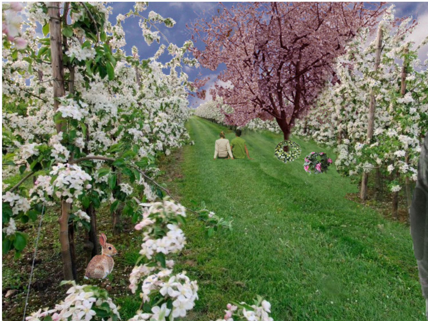
'Resting in Peace in an Orchard', an impression